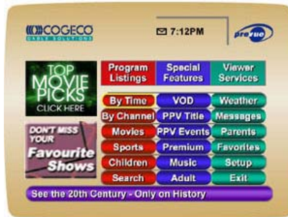
Interactive Program Guide Main Menu

Follow these simple steps to begin using VOD: