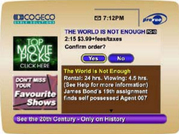
VOD Order Confirmation

If you select order, a confirmation screen appears. Highlight yes and press OK to begin watching the movie.