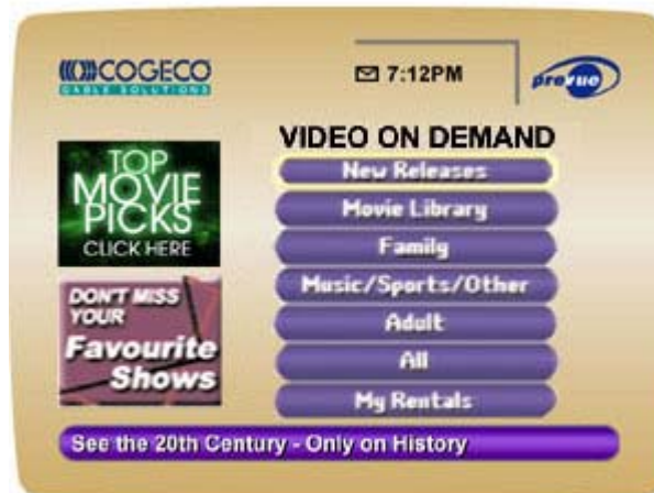
VOD Main Menu