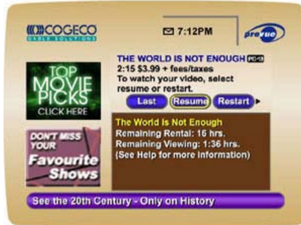
Rented Video Information Screen

Select your movie and choose either Restart or Resume from the information screen. Restart starts the movie at the beginning and Resume starts at the point you stopped.